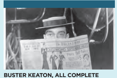
SHORTS REMASTERIZED IN HD 32x22' These 32 shorts give a huge insight into the artistic journey of the man considered by many to be celluloid's finest comic performer.