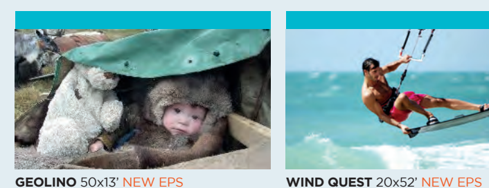
GEOLINO 50x13' NEW EPS The perfect documentary series for inquisitive boys and girls aged 5 to 16 vears. Like her big sister 360° GEO Reports, GEOlino portrays the daily lives of outstanding children and tells fascinating animal stories.