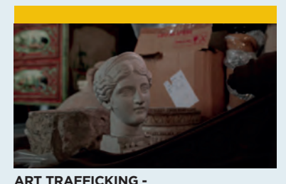
A GRAY MARKET 52' Estimated at 7 billion Euros a year, the traffic of art is the third largest traffic activity in the world, after drugs and weapons.