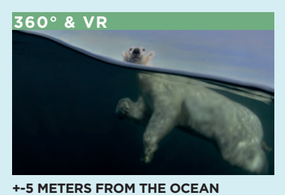
SURFACE 5x2' Scuba diving in 360°. Dive with the photographer Joe Bunni and experience the underwater world in 5 episodes.